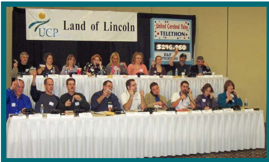
Telethon VIP's working the phone banks.

UCP would like to thank the Springfield and Decatur businesses and the individuals who donated goods and services to Telethon. A special thank you to the many people who volunteered during the Telethon. We appreciate all your hard work on behalf of United Cerebral Palsy Land of Lincoln and children with disabilities.